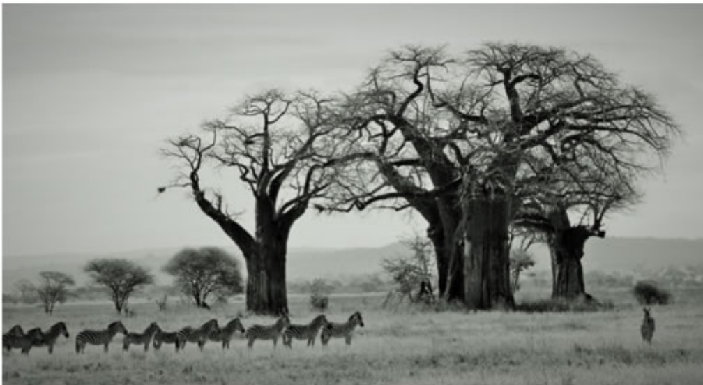
Zebra during sunset

This is meant to be a "free and easy" adventure trip. Participants should be relatively fit, with a good sense of humour, and above all, have the right attitude for close travel with others through possibly some trying times. Most definitely, this is not a trip for prudes, whiners, fuss-pots, and other similiarly assorted types! We had a couple of those before and it wasn't pleasant for us or them. Although every effort will be made to stick to the given itinerary, ground conditions may change and cause some disruption and/or deviation from the norm. Otherwise, have fun!