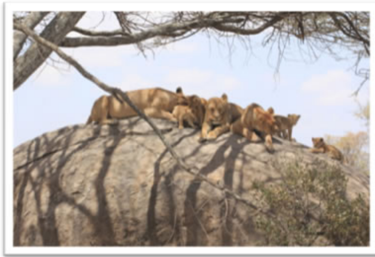
Lion taking nap at noon time

Day 5 (24 Jul): Lake Naivasha - Amboseli NP : After breakfast drive to Amboseli National Park arrive in time for lunch and short rest at Sentrim Amboseli camp. We will then go out for the afternoon game drive to enjoy game viewing against the majestic backdrop of snow-capped Mt Kilimanjaro. O/N Amboseli.