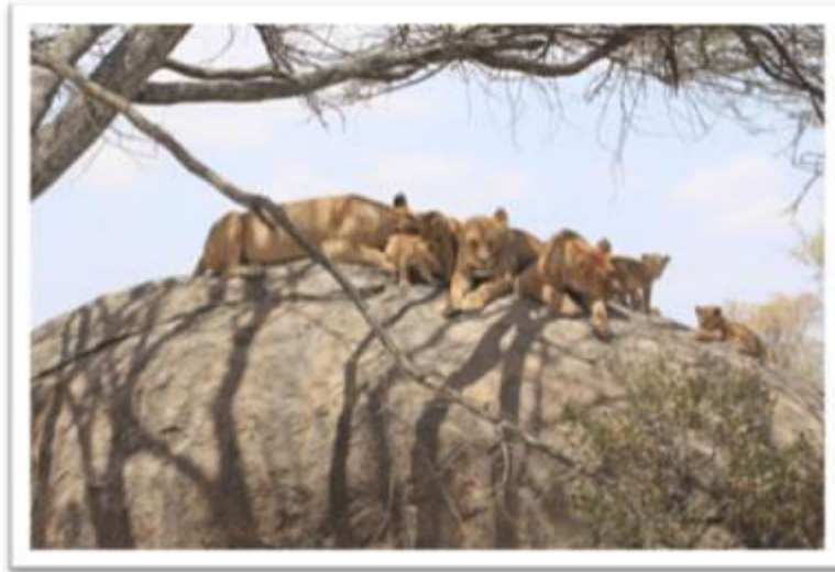
Lion taking nap at noon time (photo © Rachelheng)

Day 5 (4 Aug): Lake Naivasha - Lake Nakuru National Park – Lake Naivasha Wake up to an early breakfast then drive to Lake Nakuru National Park with picnic lunch. Arrive in time for midmorning game drive. Lunch will be had a scenic spot overlooking the beautiful Lake Nakuru. After a short rest we will enjoy more game viewing then drive back to Naivasha. O/N Naivasha.