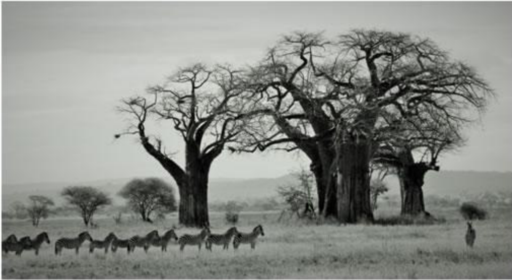
Zebra during sunset

This is meant to be a "free and easy" adventure trip. Participants should be relatively fit, with a good sense of humour, and above all, have the right attitude for close travel with others through possibly some trying times. Most definitely, this is not a trip for prudes, whiners, fuss-pots, and other similiarly assorted types! We had a couple of those before and it wasn't pleasant for us or them. Although every effort will be made to stick to the given itinerary, ground conditions may change and cause some disruption and/or deviation from the norm. Otherwise, have fun!