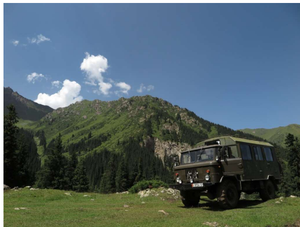
Hiking inside Altyn Arashan / Russian 4WD military ride into Altyn Arashan

Day 7 Bokonbaevo (B/L/D): After breakfast, we drive to Jeti-Oguz Gorge. Its name in Kyrgyz language means "Seven bulls". The name is symbolic, because there is a 35 km long wall of seven huge red-brown cliffs resembling furious bulls standing together. We also visit Kök-Jaik area (Valley of Flowers). Lunch included with local Kryrgyz family. Another stop at Skazka canyons (Fairy Tale canyons), before our transport takes us towards Bokonbaevo for our overnight yurt stay. Bokonbaevo town is located along the southern shore of Issyk-Kul lake, where members can enjoy swim and dip inside the lake. Dinner accompanied by folklore concert included. O/N yurt camp with shared toilets & showers available.