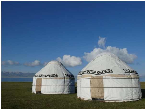
Hiking inside Altyn Arashan valley / Yurt camps at Song Kul lake

A Central Asian country located along the Great Silk Road, Kyrgyzstan is a melting pot of cultures with 40 ethnic groups – with many still practising their nomadic lifestyles. Having 95% of the country covered by mountains, the country also offers travellers plenty of beautiful landscape that includes snow-capped mountains, lakes and rivers. Come and experience the untouched country as it slowly emerges from its past Soviet governance as part of USSR. July is wonderful month to visit as it is the start of summer and welcomes visitors with variety of wild flowers and seasonal fruits.