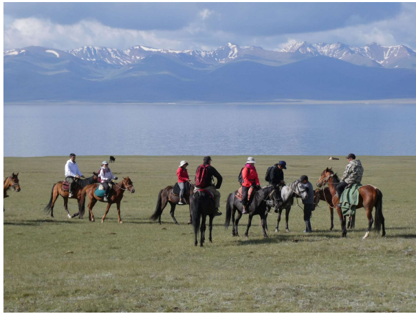
Horses at Song kul lake / Horse riding to Song Kul

Day 11 Kazarman (B/L/D): After breakfast, we drive south west towards Kazarman. Today is a long drive, but we will have few photo stops to enjoy the scenic views along the journey. Upon arrival in Kazarman, we can explore this tough mining town which used to be a bustling from its gold mining activity. O/N Kazarman in guesthouse with shared toilets , dinner provided.