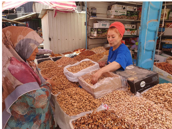
Plov demonstration / One of the many vendors inside Osh Bazaar