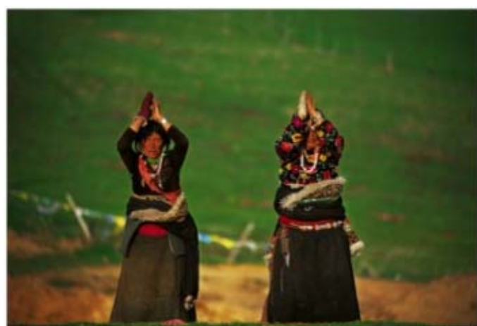
Langmusi/Tibetan women praying

<u>Day 4 Langmusi</u>: We have a full day visiting the two Tibetan monasteries, and wander about the pretty villages. There are numerous trekking possibilities and we have the services of local Tibetans to take the group around this very untouristic area of Gansu. O/N Langmusi.