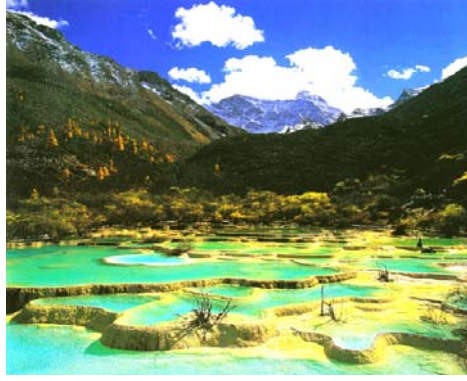
Way to Langmusi /Zoige/ Huanglong