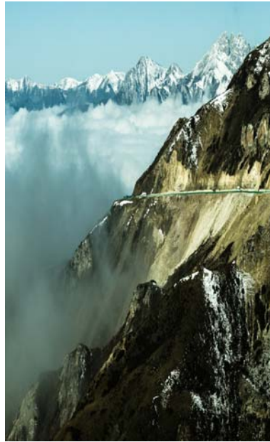
1st Bend of Huanghe river & Huanglong

Day 7 Huanglong(100km 3hr): We bus 3hr to Huanglong, translated Yellow Dragon, another beautiful park studded with waterfalls and travertine ponds of blue, yellow, white and green. The top temple is 7.5 km from the entrance and has the most beautiful pools. Cable cars are available for visitors to get quickly to the top. ON Jiuzhaigou (Zhachang town)