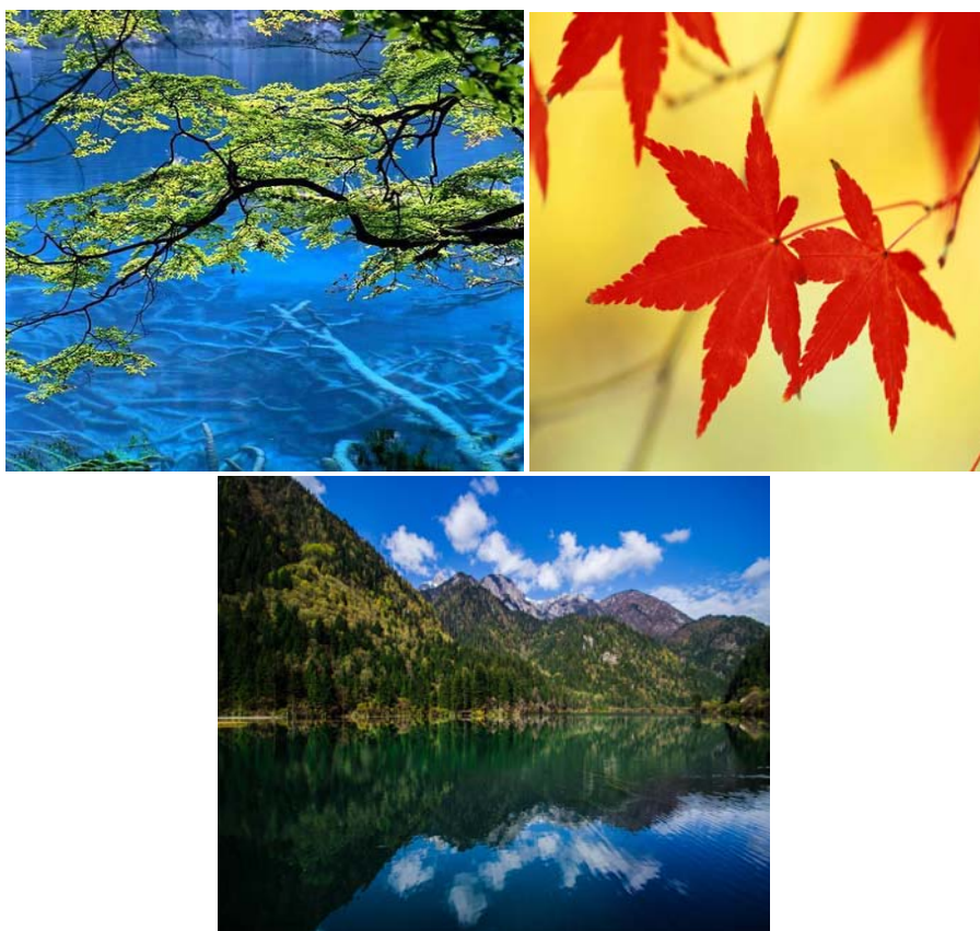
Jiuzhaigou stunning View

IMPORTANT NOTICE: This is meant to be a "free and easy" adventure trip. Participants should be relatively fit, with a good sense of humor, and above all, have the right attitude for close travel with others through possibly some trying times. Most definitely, this is not a trip for prudes, whiners, fuss-pots, and other similarly assorted types! We had a couple of those before and it wasn't pleasant for us or them. Although every effort will be made to stick to the given itinerary, ground conditions may change and cause some disruption and/or deviation from the norm. Otherwise, have fun.