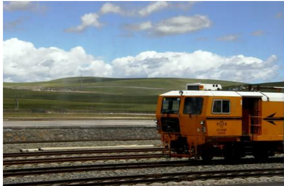
Stunning View along the journey/Qinghai Train