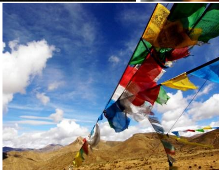
Night View on Potala Palace/ Tibetan boy/ Prayer Flag

Tibet Autonomous Region is located at the Southwest part of China, with a land area of 1.22 million sq km and a population of 2.3 millions, in which 95% are Tibetan nationality. There are also 30 other nationalities in Tibet, such as Han, Menba, Luoba, Hui, Monggul, Naxi as well as Cheng and Sharba peoples.