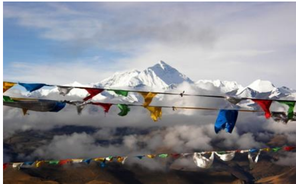
Fortunate to view difference clear angle of Mt Everest

Day 9 Tingri -Shigatse: Drive to Shigatse to visit Pachen Lama's seat palace, the great Tashilumpo monastery, a very big and complex monastery in Tibet. Back to Shigatse. ON Shigatse.