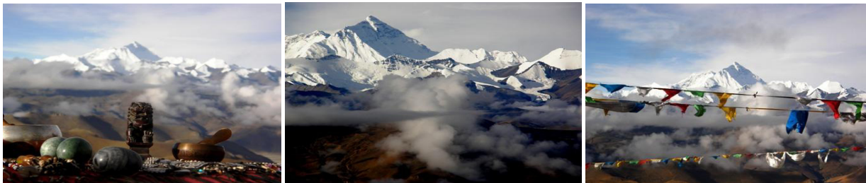
Fortunate to view difference clear angle of Mt Everest

Day 8 Tingri-Mt Everest Base Camp-Tingri: After hours of driving we arrive at the highest monastery of the world, the Rongbuk monastery. Upon arrival, go to Mt. Everest Base Camp (5200m). You can appreciate the highest mountain in the world- Mt.Everest (8848m). Back to Tingri. ON Tingri.