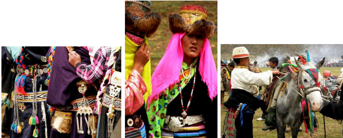
Passed by interesting local festival

Day 5 Lhasa-Yamdrok-Gyantse: Today we will continue our journey to other places of Tibet. About hundred kilometers, you will appreciate the holy Lake of Yamdrok Lake. Drive to historical city Gyantse. On the way, we can see the Karola Glacier Visit Pelkhor monastery for its famous Kumbum Pagoda . ON Gyantse.