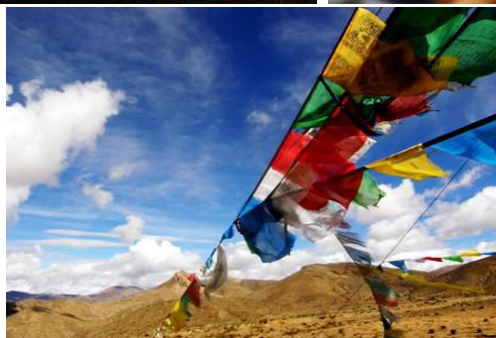
Night View on Potala Palace/ Tibetan boy/ Prayer Flag

Tibet Autonomous Region is located at the Southwest part of China, with a land area of 1.22 million sq km and a population of 2.3 millions, in which 95% are Tibetan nationality. There are also 30 other nationalities in Tibet, such as Han, Menba, Luoba, Hui, Monggul, Naxi as well as Cheng and Sharba peoples.