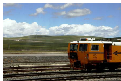
Stunning View along the journey/Qinghai Train