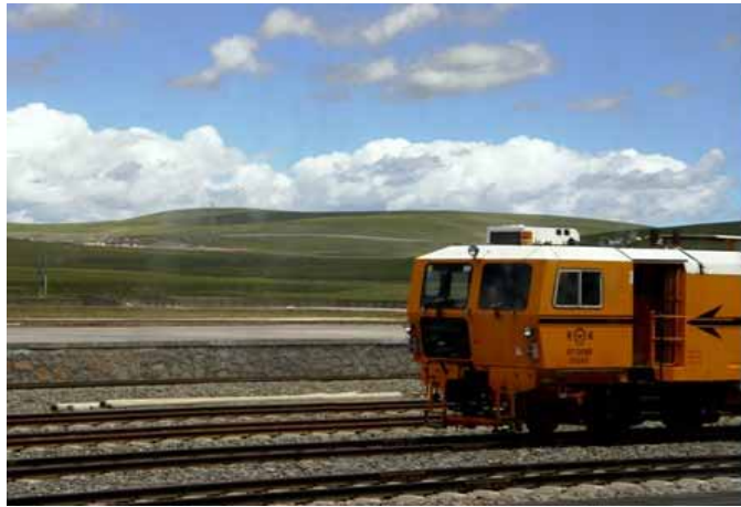
Stunning View along the journey/Qinghai Train