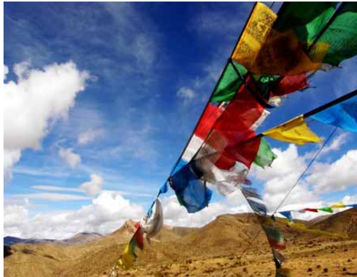
Night View on Potala Palace/ Tibetan boy/ Prayer Flag

Tibet Autonomous Region is located at the Southwest part of China, with a land area of 1.22 million sq km and a population of 2.3 millions, in which 95% are Tibetan nationality. There are also 30 other nationalities in Tibet, such as Han, Menba, Luoba, Hui, Monggul, Naxi as well as Cheng and Sharba peoples.