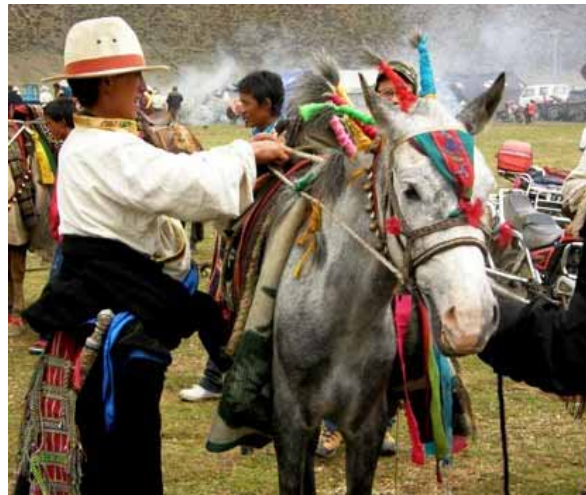
Passed by interesting local festival

Day 6 Gyantse-Shigatse: On the way to Shigates have a mountain village family visit for a glimpse of everyday Tibetan life. Drive to Shigates to visit Palcho monastery, this monastery famous that its remarkable feature accomodates the three sects of Tibetan Buddhism in one monastery coexisting in peace with each other. The Palcho Monastery is in coexistence of the three sects namely, the Sakya, the Kagyu and the Gelug. ON Shigatse.