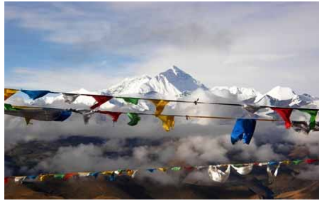
Fortunate to view difference clear angle of Mt Everest

Day 9 Tingri -Shigatse: Drive to Shigates to visit Pachen Lama's seat palace, the great Tashilumpo monastery, a very big and complex monastery in Tibet. Back to Shigatse. ON Shigatse.