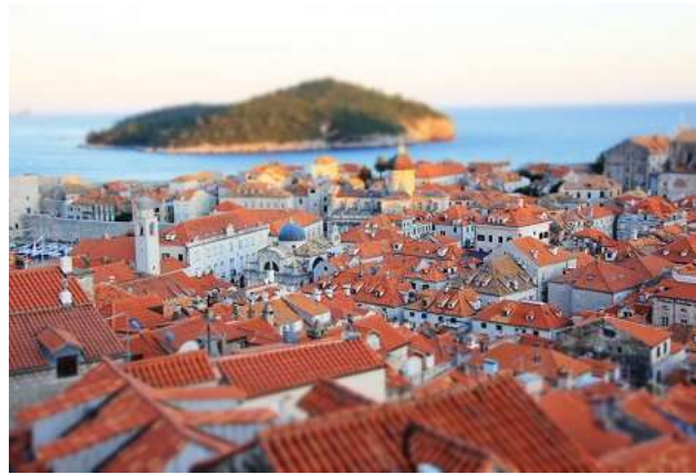
Dubrovnik, one of the beautiful UNESCO town

Day 13 Split: Early morning, we take the regular local bus 8AM - 1230PM towards Split 4.5hr, located along the Dalmatian coast. Split is Croatia's second largest city, and was once a retreat for the Roman emperors. The Roman Emperor Diocletian, built his Palace here which has now been enlisted as a UNESCO World Heritage site. Option to join a local guided tour. Or simply get lost wandering inside the Palace grounds with many narrow streets filled with shops, restaurants and cafes. O/N Split for 2nights in self-catering apartments 2-4pax, no breakfasts provided.