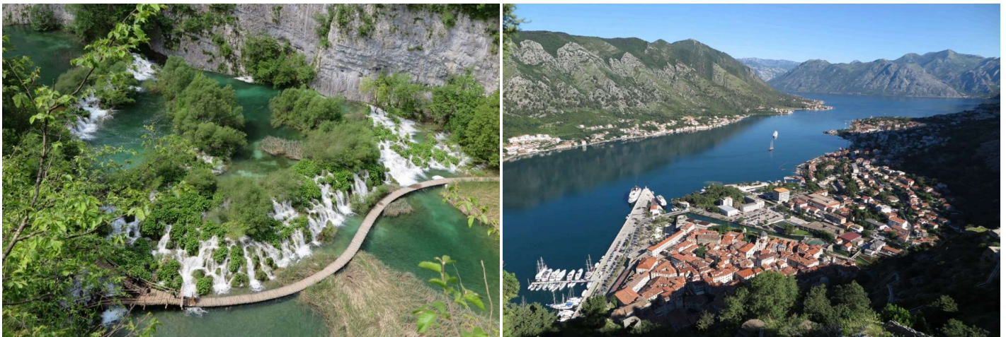
Waterfalls at Plitvice National Park / View of Kotor old town

IMPORTANT NOTICE: This is meant to be a "free and easy" adventure trip. Participants should be relatively fit, with a good sense of humor, and above all, have the right attitude for close travel with others through possibly some trying times. Most definitely, this is not a trip for prudes, whiners, fussy-pots, and other similarly assorted types! We had a couple of those before and it wasn't pleasant for us or them. Although every effort will be made to stick to the given itinerary, ground conditions may change and cause some disruption and/or deviation from the norm. Otherwise, have fun !