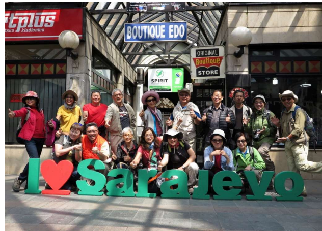
Sarajevo night view / Group at Sarajevo

Day 8 Zabljak: We charter a bus to cross border into Montenegro towards Durmitor National Park . The park is a UNESCO site and home to Tara river canyon, one of the world's deepest river canyon. Along the way, we stop at historic site of Pocitelj with option to climb up the old fort walls. Overnight in Zabljak, closest town to Durmitor NP. Stay in self-catering apartments for 2-4pax, with no breakfast provided but cooking facilities available.