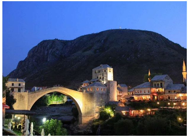
Strbacki Buk waterfall along Una River, Bihac / Mostar old Bridge

Day 5 Travnik & Sarajevo (B): After breakfast, our chartered bus takes us to medieval town of Travnik , some 4hr away. The local market is busy with a good mix of multi-religious Bosnians going about their business in this small town place for lunch, trout meals recommended. Members have option to walk up to the medieval Turkish castle, which was the seat of the 77 Turkish viziers who ruled Bosnia for 150 years. Later, we move on to Sarajevo 90 km 2hr. Sarajevo is the capital & largest city of Bosnia Herzegovina. Stay in budget hotel doubles/triples with attached bathrooms, no breakfast. O/N Sarajevo