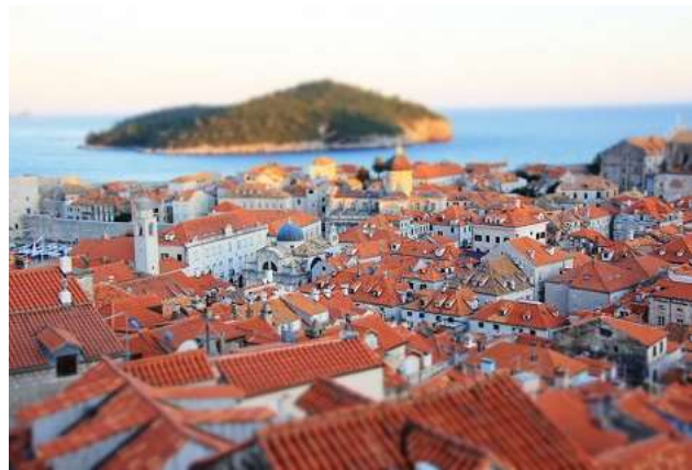
Dubrovnik, one of the beautiful UNESCO town

Day 13 Split: Early morning, we take the regular local bus 8AM - 1145AM towards Split 4.5hr, located along the Dalmatian coast. Split is Croatia's second largest city, and was once a retreat for the Roman emperors. The Roman Emperor Diocletian, built his Palace here which has now been enlisted as a UNESCO World Heritage site. Option to join a local guided tour. Or simply get lost wandering inside the Palace grounds with many narrow streets filled with shops, restaurants and cafes. O/N Split for 2nights in self-catering apartments 2-4pax, no breakfasts provided.