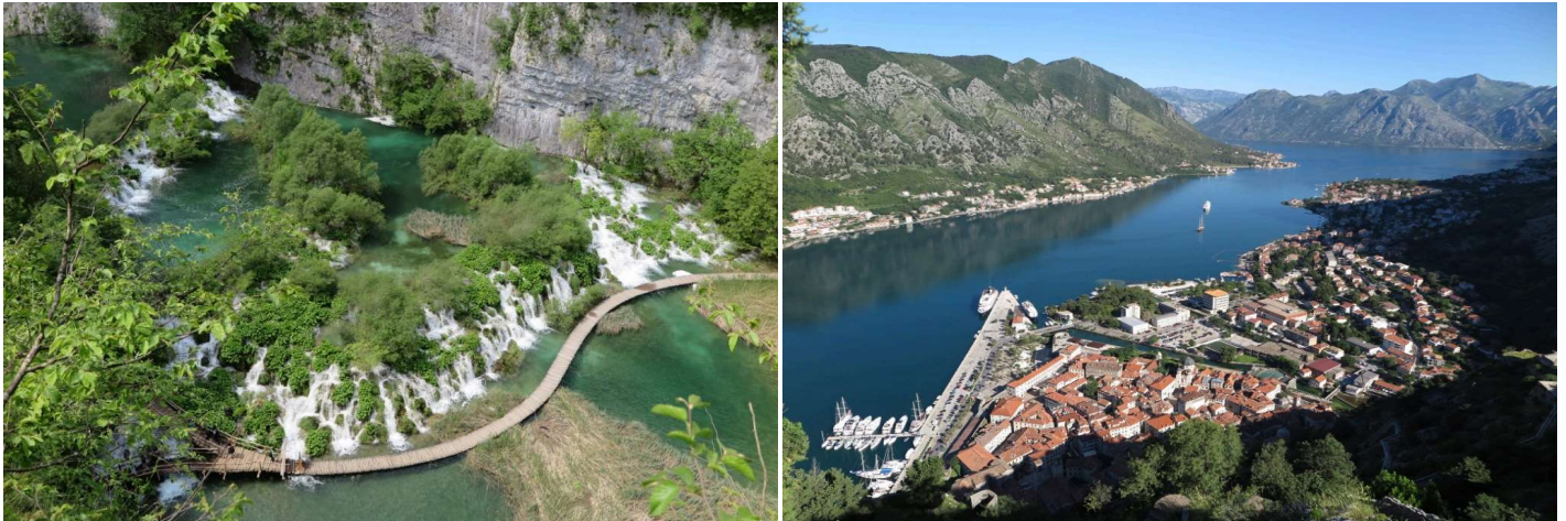
Waterfalls at Plitvice National Park / View of Kotor old town

IMPORTANT NOTICE: This is meant to be a "free and easy" adventure trip. Participants should be relatively fit, with a good sense of humor, and above all, have the right attitude for close travel with others through possibly some trying times. Most definitely, this is not a trip for prudes, whiners, fussy-pots, and other similarly assorted types! We had a couple of those before and it wasn't pleasant for us or them. Although every effort will be made to stick to the given itinerary, ground conditions may change and cause some disruption and/or deviation from the norm. Otherwise, have fun !