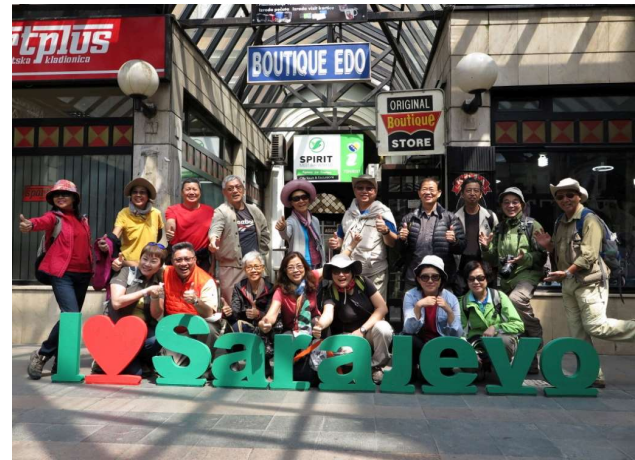
Sarajevo night view / Group at Sarajevo

Day 8 Zabljak: We charter a bus to cross border into Montenegro towards Durmitor National Park . The park is a UNESCO site and home to Tara river canyon, one of the world's deepest river canyon. Along the way, we stop at historic site of Pocitelj with option to climb up the old fort walls. Overnight in Zabljak, closest town to Durmitor NP. Stay in self-catering apartments for 2-4pax, with no breakfast provided but cooking facilities available.