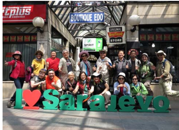
Sarajevo night view / Group at Sarajevo

Day 8 Zabljak : We charter a bus to cross border into Montenegro towards Durmitor National Park . The park is a UNESCO site and home to Tara river canyon, one of the world's deepest river canyon. Along the way, we stop at historic site of Pocitelj with option to climb up the old fort walls. Overnight in Zabljak, closest town to Durmitor NP.