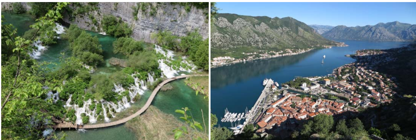
Waterfalls at Plitvice National Park / View of Kotor old town

IMPORTANT NOTICE: This is meant to be a "free and easy" adventure trip. Participants should be relatively fit, with a good sense of humor, and above all, have the right attitude for close travel with others through possibly some trying times. Most definitely, this is not a trip for prudes, whiners, fussy-pots, and other similarly assorted types! We had a couple of those before and it wasn't pleasant for us or them. Although every effort will be made to stick to the given itinerary, ground conditions may change and cause some disruption and/or deviation from the norm. Otherwise, have fun !