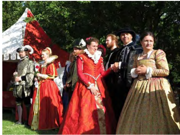
Dressed up for Five Petalled Rose celebrations

This will be a backpack experience using a mix of public buses/trains and some chartered minibuses from town to town . The minibus hires are for day trip in Poprad, Stary Smokovec to Zakopane, Zakopane to Krakow and Cesky Krumlov to Vienna. We stay in pensions and hostels in rooms with private bath ranging from 2 to 4 pax sharing room . Its quite important participants are able to manage their own luggage and we suggest backpacks or small trolley bags . As usual, you pay for your own meals, cable car rides, entrance fees, within-the-town taxis/trams and other activities, unless stated otherwise.