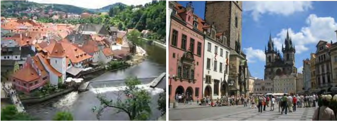
Small town Cesky Krumlov / Prague town square