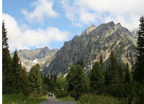
Trekking and Tatry Mountains Slovakia

Day 7 Zakopane & Kasprowy Wierch Poland: We hire a bus to take the group directly into Zakopane, Poland. This is the main town in the Polish Tatry Mountains. We proceed to Kuznice for a cable car ride (own cost about Rm75) up to Kasprowy Wierch 1987m, a famous snow peak in Poland. After that, group is free to wander about this beautiful mountain village Zakopane, which is filled with good-value restaurants, pubs and outdoor shops. Stay doubles/triples with private bath in pension in Zakopane with breakfast. Minibus transfer covered. O/N Zakopane