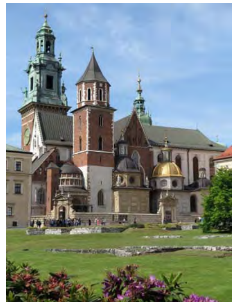
Auschwitz Birkenau Camps / Wawel castle grounds at Krakow