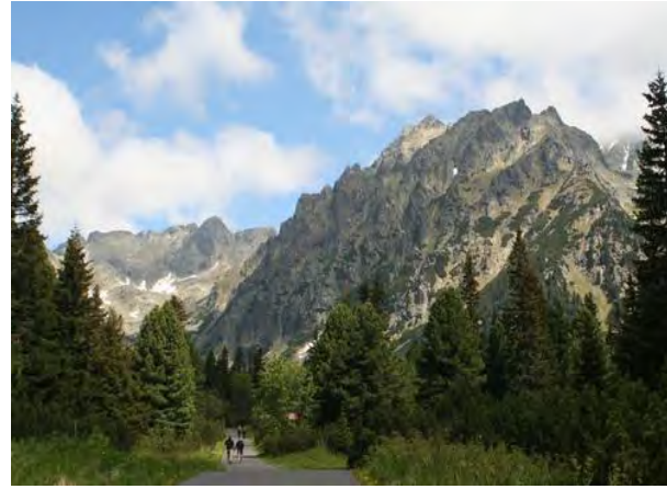
Trekking and Tatry Mountains Slovakia

Day 5 Zakopane & Kasprowy Wierch Poland: We hire a bus to take the group directly into Zakopane, Poland. This is the the main town in the Polish Tatry Mountains. We proceed to Kuznice for a cable car ride (own cost about Rm75) up to Kasprowy Wierch 1987m, a famous snow peak in Poland. After that, group is free to wander about this beautiful mountain village Zakopane, which is filled with good-value restaurants, pubs and outdoor shops. Stay doubles/triples with private bath in pension in Zakopane with breakfast. Minibus transfer covered. O/N Zakopane