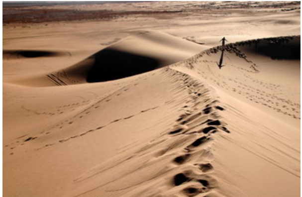
Shopping / Chigaga Dunes / Centuries old tannaries of Fes