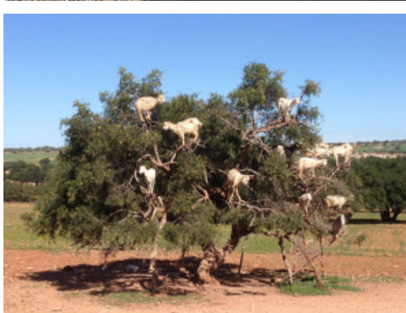
Roman Ruins Volubilis / UNESCO Ait-Ben-Haddou / Todra Trekking / Climbing Goats

Day 6 Tinghir. It's a long bus ride into the High Atlas today, as we take in a 10 hours trip to Tinerhir. However, the change of scenery as we start our uphill ascend will surely keep all awake, at least some of the time. Tinerhir is a city in the region of Draa-Tafilalet, an oasis sandwich between High Atlas and Little Atlas. The beautiful palmeraie or oasis along the Todra river simply takes your breath away. O/n Tinerhir. Dinner included. (D/B)