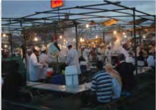
Shopping / Chicaga Dunes / Centuries old tannaries of Fes / Food square of Marrakesh

Day 0 night Meet up at KLIA by 10PM Fri 3 Nov 2017 for past midnight flight.