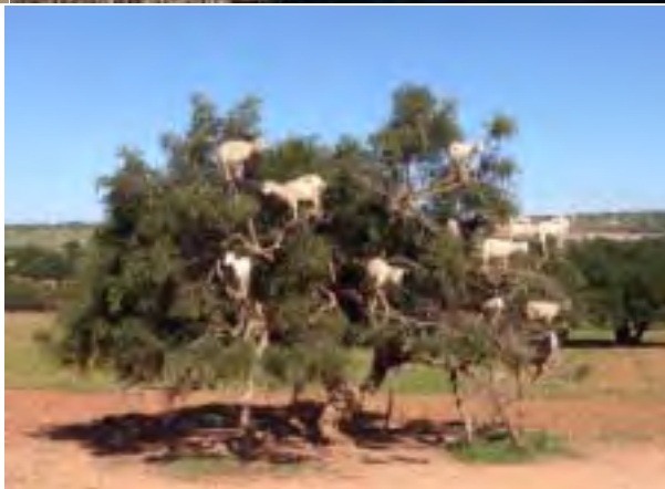
Roman Ruins Volubilis / UNESCO Air Ben Haddou / Tadra Trekking / Climbing Goats

Day 7 Tinerhir: It's a long bus ride into the High Atlas today, as we take in a 10hr trip to Tinerhir. However, the change of scenery as we start our uphill ascent will surely keep you awake, at least some of the time. O/n Tinerhir dinner breakfast included.