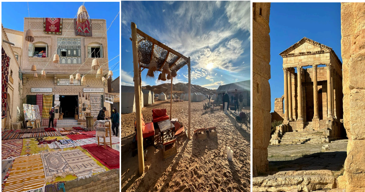
Medna of Tozeur / Sahara Desert / Byzantine ruins Sufetula Sbeitla

IMPORTANT NOTICE: This is meant to be a "free and easy" adventure trip. Participants should be relatively fit, with a good sense of humor, and above all, have the right attitude for close travel with others through possibly some trying times. Most definitely, this is not a trip for prudes, whiners, fuss-pots, and other similarly assorted types! We had a couple of those before and it wasn't pleasant for us or them. Although every effort will be made to stick to the given itinerary, ground conditions may change and cause some disruption and/or deviation from the norm.