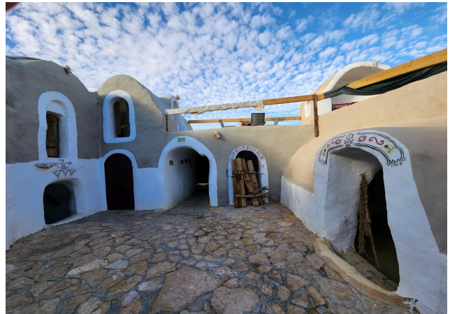
Location of Star Wars movies Northern Tunisia

Day 8 Matmata. After breakfast, leave the desert for Matmata, famous for its unusual housing structure, known as "troglodyte." Scenes from a number of Star Wars movies were filmed here. ON Matmata (Breakfast Dinner included)