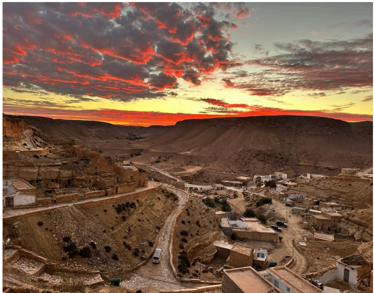
Sidi Bou Said / Village of Chenini