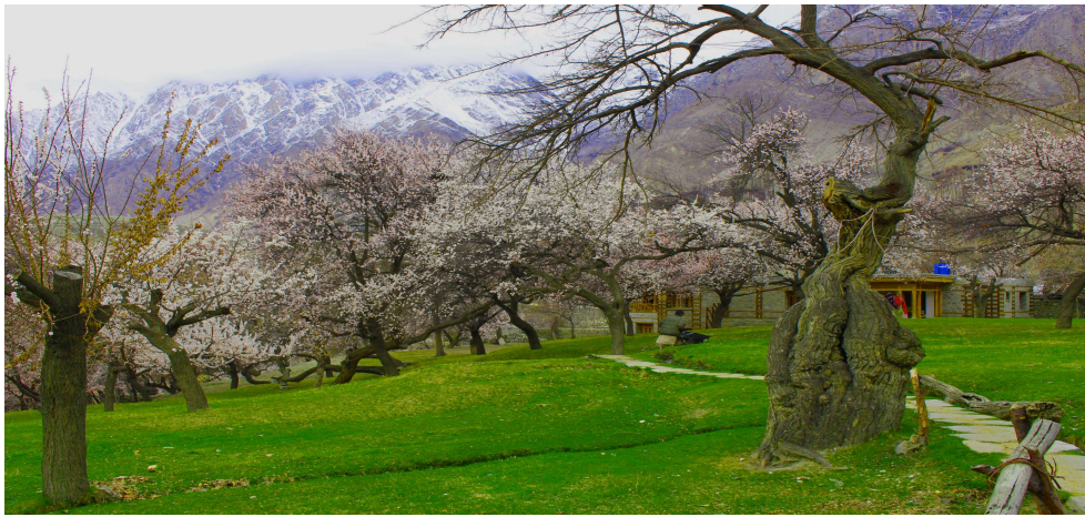
Spring in Hunza Valley

Day 1 KUL-Islamabad: Meet in KLIA for direct flight PK895 KUL to Islamabad 1330/1620hr . Reached Islamabad and check in hotel. Overnight (ON) Islamabad.