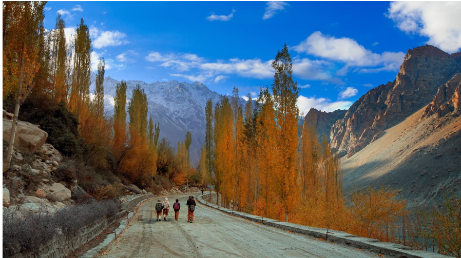
Autumn in Pakistan

Flight schedule is based on today's PIA airlines while fare excluded taxes approximately Rm2500-2800 and will be updated once out. (NOTE : Please DO NOT purchase air ticket until YONGO advise AFTER trip is confirmed to run).