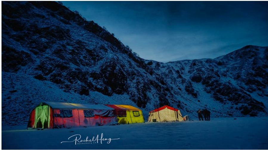
Hapakun Camp site view

Day 8 Taghaphari - Hapakun-Minapin-Karimabad : Trek down to Hapakun appx 2 hours, after lunch trek down to Minapin 2 hours and then drive all the way to Karimabad about 1hr. Transfer to hotel. O/N Karimabad. (Breakfast Lunch included)