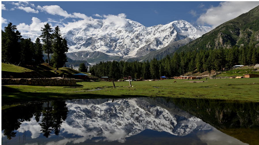
Stunning view from Fairy Meadow

Day 3 Chilas - Fairy Meadows (3306m) : Drive to Raikot bridge 56KM (1.5 hour) transfer to 4x4 jeeps, which takes us to Tato village (1-2 hr) and trek to Fairy Meadows 2-3hrs, 5.5km, 640m ascent, Altitude 3306m (have a Spectacular view of Nanga Parbat 8125m). Overnight in huts. (All meals included)