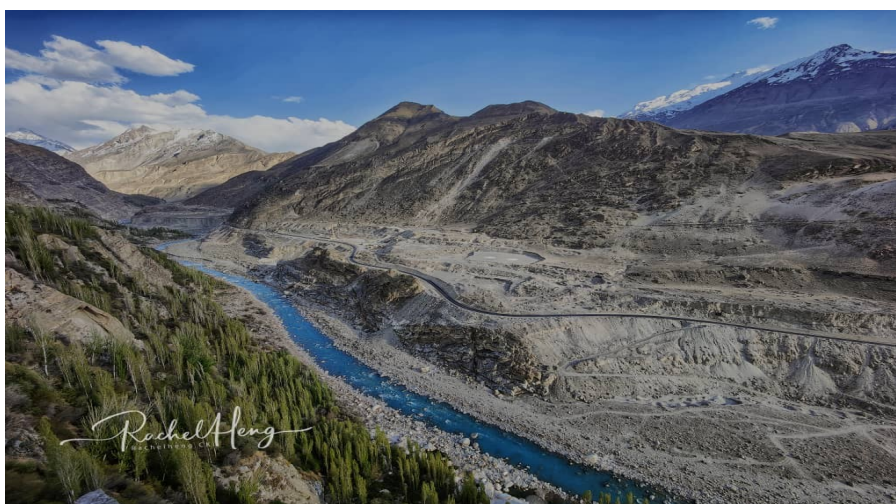
View from Baltit Fort

Baltit fort: One of the high valleys between China and Indian subcontinent. Facing Rakaposhi Peak, one of the highest mountain peaks in the world, Baltit Fort is poised majestically above Karimabad, the present day capital of Hunza (Baltit was the capital of the old state of Hunza and is now included in the Karimabad settlement area).