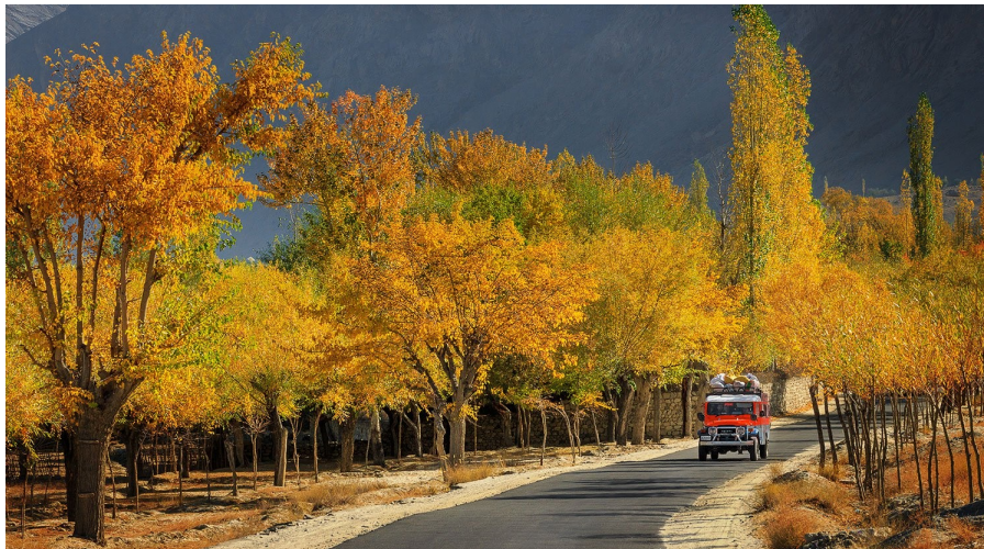
Autumn colour in Pakistan

Flight ticket is based on 2024 Batik & PIA airlines schedule and fare excluded taxes approximately Rm3200 and will be updated if there is any changes. (NOTE : Please DO NOT purchase air ticket until YONGO advise AFTER trip is confirmed to run).