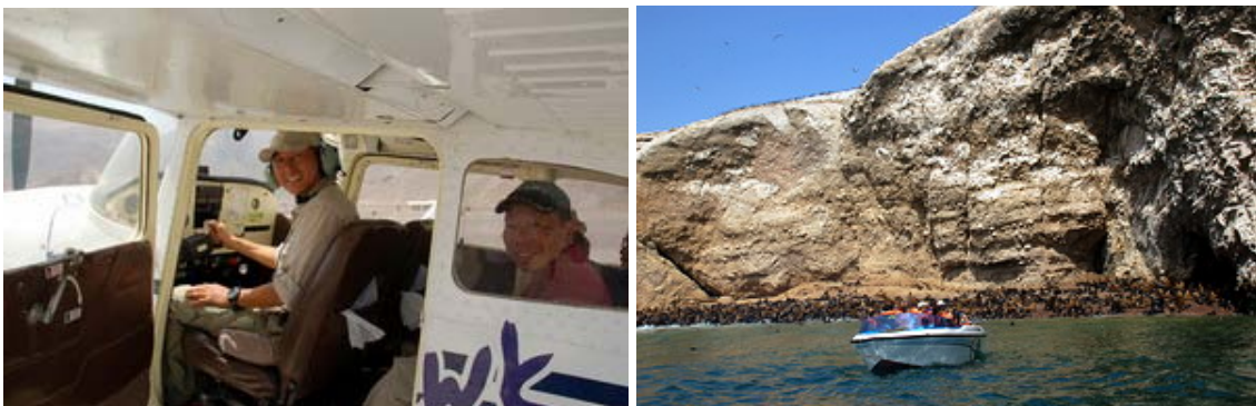
Fly over Nazca Lines / Ballestas Island Sea Lions & seabirds

Day 24 KLIA . Arrive home 350PM THU 15 Mar 2018 after 12hr flight.