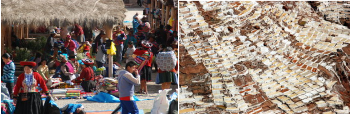
Chincheru Sunday Market / Maras Salt Pans

Day 12 La Paz . Our hotel is next to a 3 km long street with a lively and colourful market. Bolivia is one of the poorest countries in South America and the street scenery is very different from that of Lima and other towns in more developed Peru. The morning market is especially attractive with kilometers long stalls exhibiting a wide range of products. Optional half-day City tours can be arranged at own cost. At night we take an overnight express bus to Uyuni.