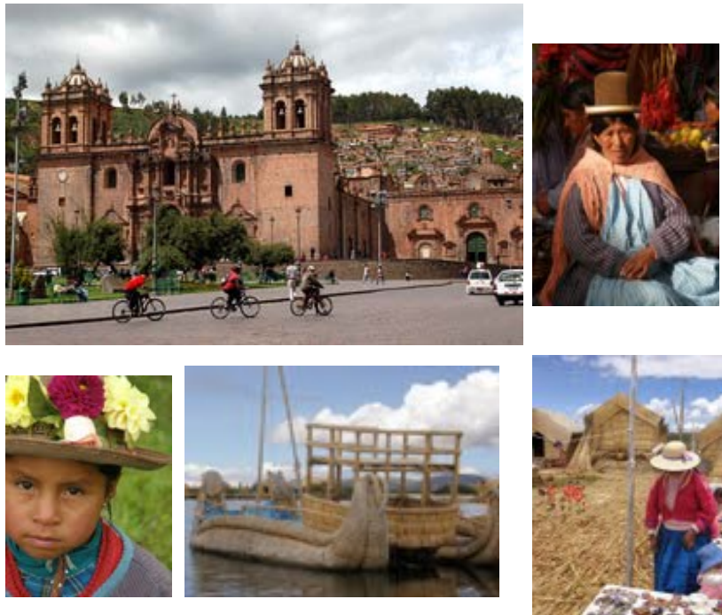
Capital of Incas Cusc / Locals / Reed boat at Lake Titicaca

Day 7 Machu Picchu . Start at 6am with a 25min bus ride up to Machu Picchu. Entrance fee Rm200 (includes Huayna Picchu fees) is included. We engage a professional guide for Machu Picchu which means small mountain, who will take the group to the various viewpoints. The usual places of visit are the farm terraces, Main Square, Temple of the Sun, Temple of Condor and the residential areas. The city was abandoned for unknown reasons and was not "harmed" by the Spanish as most of the buildings are original. The guide spends 4 hr with the group. Then it is free time to explore the ruins. Recommended is a 1 hr walk/trek/climb up Huayna Pichhu translated big mountain, for amazing top-down views of Machu Picchu as well as the high ruins and temples located on top of Huayna Pichhu. Those who are less physically inclined can walk the gentle Inca trail to the Sun Gate for alternative views of Machu Picchu. We late lunch in Aguas Calientes before taking the Turista train 412pm-550pm to Ollantaytambo, where a bus takes us to Cusco 89km 2hr. ON Cusco.