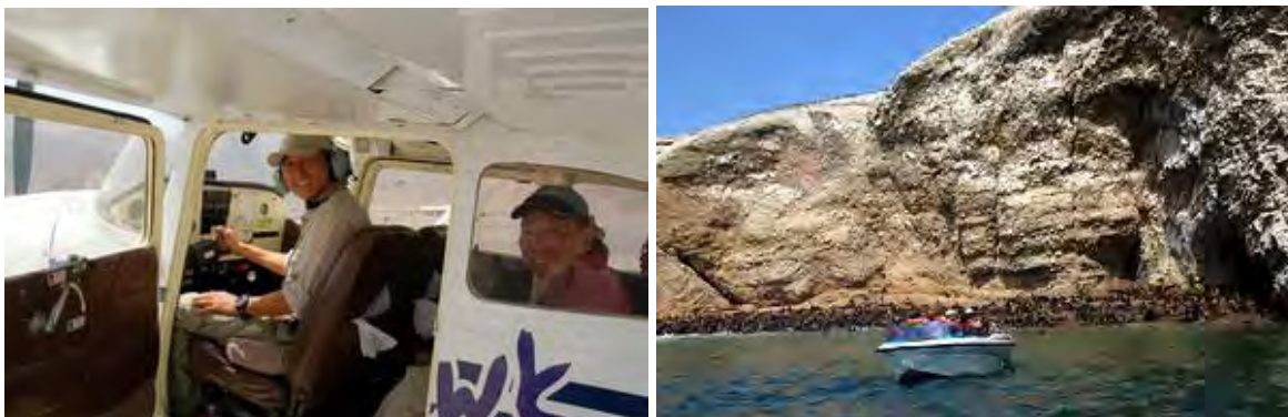
Fly over Nazca Lines / Ballestas Island Sea Lions & seabirds

Day 24 KLIA. Arrive home 350PM THU 15 Mar 2019 after 12hr flight.