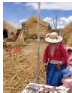
Capital of Incas Cusc / Locals / Reed boat at Lake Titicaca

Day 7 Pisac Ruins & Market. We first visit the Bolivia Consular for visa application. Our destination this morning is the Pisac Ruins 2hr bus, with several photo stops along the way. The agricultural terraces found here were used for crop research and test cropping. At the very top one finds a few sets of ruins used for ceremonial and residential purpose. We adjourn to the famous Pisac Market 30 min away. On the way back, we visit Sacsayhuaman (easy pronunciation as Sexy Woman), the largest that is sited on top of a hill overlooking Cusco. The site was also a great place for scenic photos of Cusco. All these entrances are included in the Cusco Boleto Turistico. We return to Cusco for more City wanderings and our last night stay. ON Cusco.