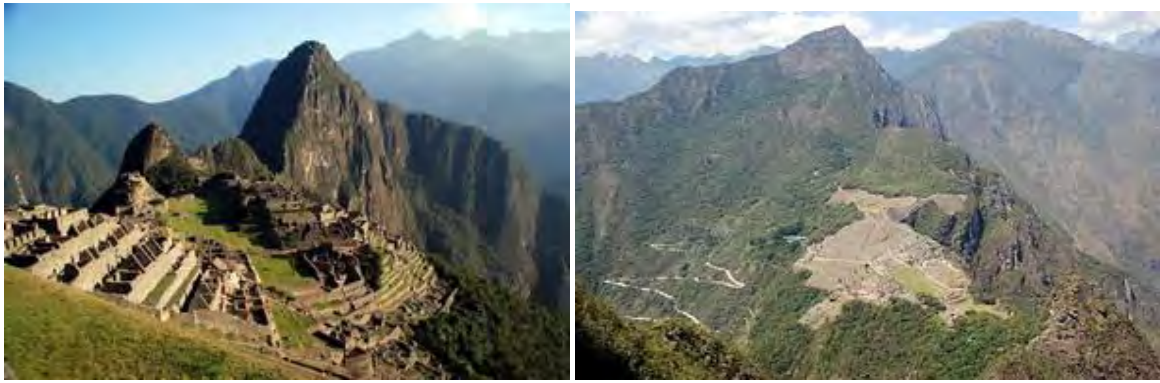
Machu Picchu Standard View / Machu Picchu from Huayna Picchu

Day 17 Border to Arequipa. Arrive 540AM and cross the border by taxis to Peruvian town of Tacna 1.5hr, where we have breakfast. We proceed by public bus to Arequipa 5hr. We have time to visit the Plaza de Armas, the Churches and more colonial buildings. ON Arequipa.