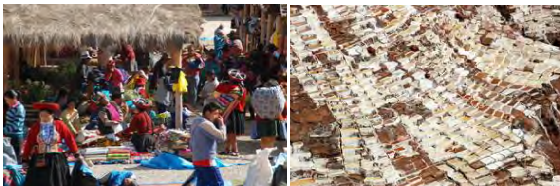
Chinchero Sunday Market / Maras Salt Pans

Day 12 La Paz Market, City Tour, Overnight Bus. Our hotel is next to a 3 km long street with a lively and colourful market. Bolivia is one of the poorest countries in South America and the street scenery is very different from that of Lima and other towns in more developed Peru. The morning market is especially attractive with kilometers long stalls exhibiting a wide range of products. Optional half-day City tours can be arranged at own cost. At night we take an overnight express bus to Uyuni. ON Bus