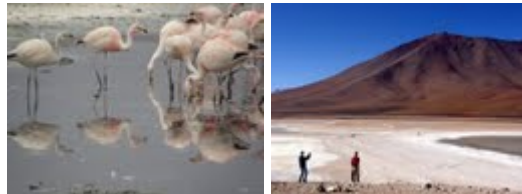
Uyuni Laguna Canapa/ Group Photo at Salar Uyuni (Salt Plains)/ Flamingo

This will be a semi-backpack experience using a couple of local express bus rides and some chartered buses traveling from town to town. We stay in good clean guesthouse in all places except for 3 days Salar Uyuni tour. It is important participants are able to manage their own luggage and backpacks are a must. Like most Yongo trips, you pay for your own meals and entrances, except for those specified below. You also pay the within-the-town taxis and other activities not specified below.