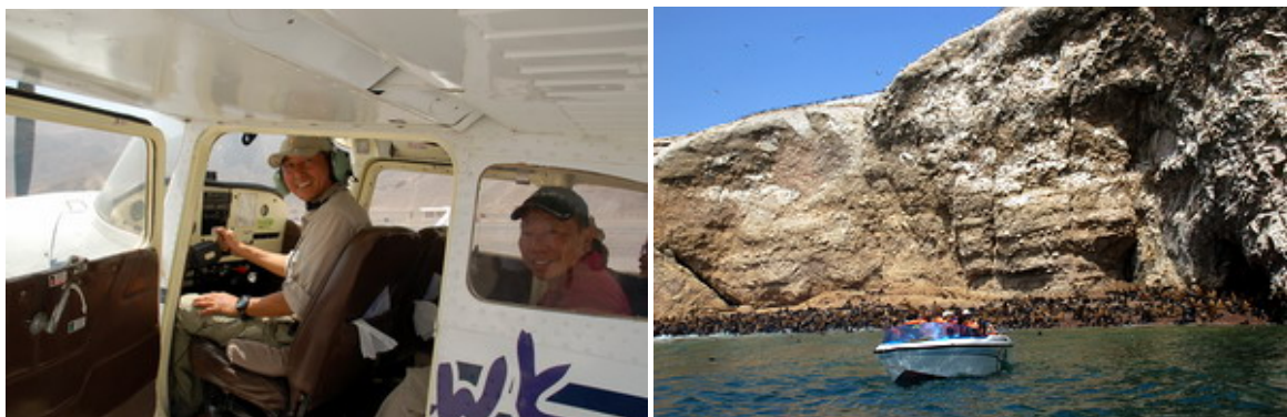
Fly over Nazca Lines / Ballestas Island Sea Lions & seabirds

Day 24 KLIA. Arrive home 340PM THU 23 Mar 2023 after 12hr flight.