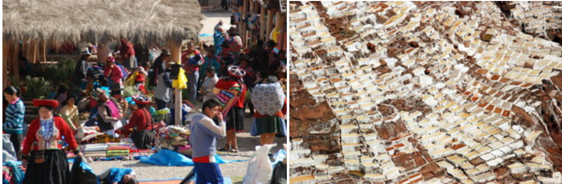
Chincheru Sunday Market / Maras Salt Pans

Day 12 La Paz Market, City Tour, Overnight Bus. Our hotel is next to a 3 km long street with a lively and colourful market. Bolivia is one of the poorest countries in South America and the street scenery is very different from that of Lima and other towns in more developed Peru. The morning market is especially attractive with kilometers long stalls exhibiting a wide range of products. Optional half-day City tours can be arranged at own cost. At night we take an overnight express bus to Uyuni. ON Bus