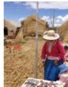
Capital of Incas Cusc / Locals / Reed boat at Lake Titicaca

Day 8 Pisac Ruins & Market. Our destination this morning is the Pisac ruins 2hr bus, with several photo stops along the way. The agricultural terraces found here were used for crop research and test cropping. At the very top one finds a few sets of ruins used for ceremonial and residential purpose. We adjourn to the famous Pisac Market 30 min away. We return to Cusco for more City wanderings and our last night stay. ON Cusco.