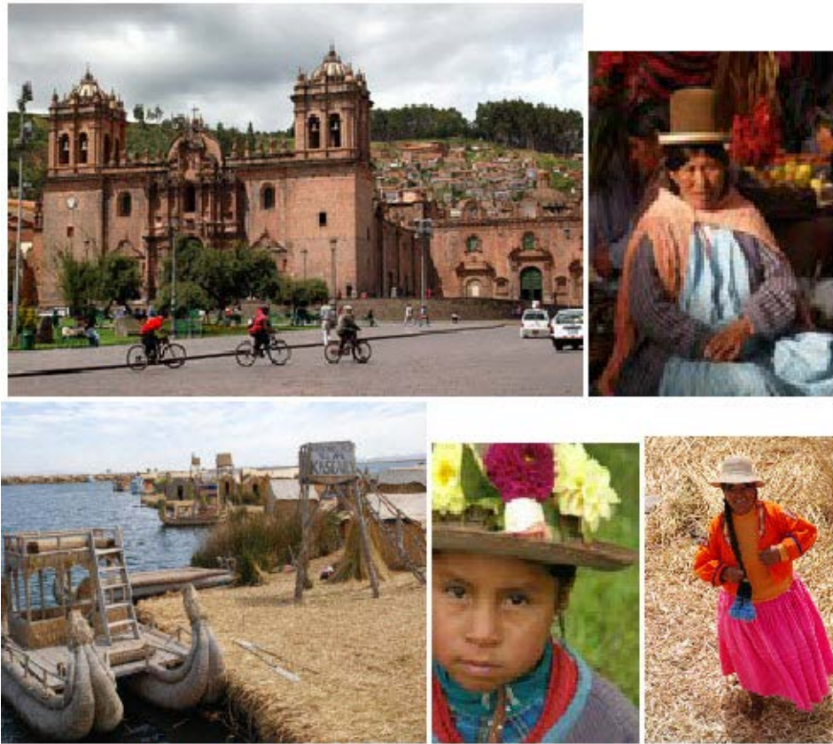
Capital of Incas CUSCO / Locals / Reed boat at Lake Titicaca

Day 10 Cusco to Puno. We board 730AM bus tour on the Tourist Bus Tour to Puno, a journey of 380km over the surreal Altiplano (high altitude Andean plateau), its highest point at La Raya 4335m. The stops include Andahuayllillas, a 3122m Mestizo baroque architecture church and Raqchi at 3400m Inca temple of Wirachocho God and home to Raqchi people with their distinct clothing. It is amazing to note that there were 20,000km of Inca Trail, which are rock paved trails linking the vast Inca Empire. It also passes through towns like Raqchi. Estimated arrival time in Puno is 5PM. Tour cost includes lunch and entrance fees are included in trip cost. ON Puno.