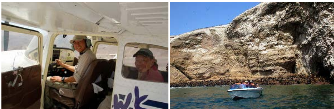
Fly over Nazca Lines / Ballestas Island Sea Lions & seabirds

Day 25 KLIA. Transit 2:40hr before fly Singapore (1810) to KUL (1920) FRI 12 APR 2024 6:10 PM.