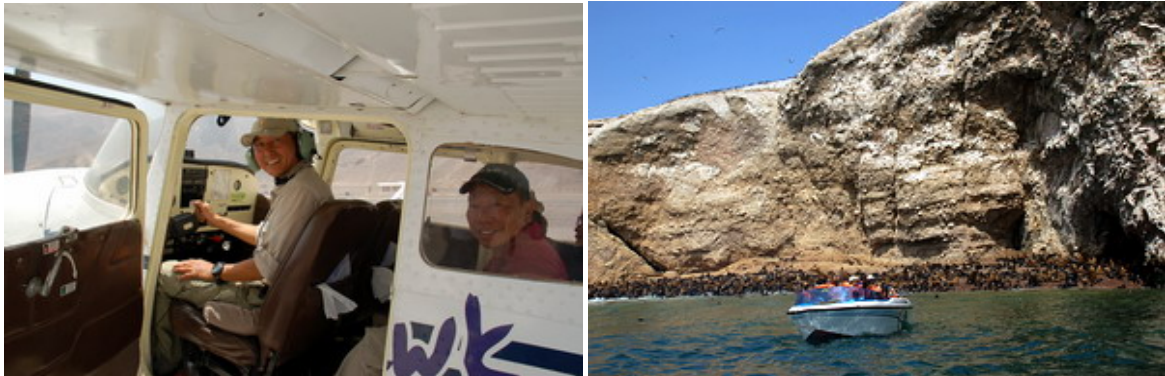
Fly over Nazca Lines / Ballestas Island Sea Lions & seabirds

Day 25 KLIA. Transit 2:55hr before fly Bangkok (1105) to KUL (1415) FRI 12 APR 2024 2:15 PM.