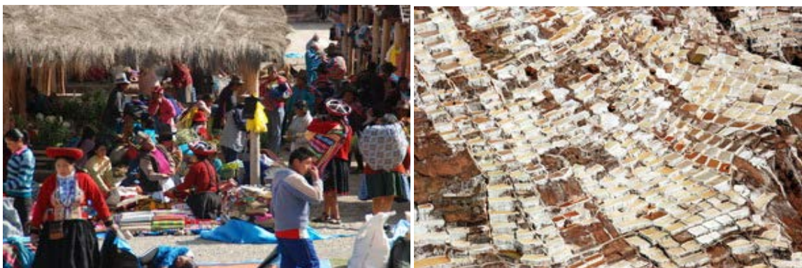
Chincheru Sunday Market / Maras Salt Pans

Day 15 Uyuni Day 2. We cross Salar de Chiguana, a thin salt crusted plain. The track climbs 4000m plus to the only active volcano in Bolivia, the 5865m Ollgue. The scenery along the way is excellent, flanked by rust coloured plains and topped by snow-capped mountains. The area abounds with wild vicunas, related to the Llama, Alpaca and is a distant relative of the camels. We visit a number of lakes including the surreal Laguna Canapa with its multi-coloured mineral-filled waters. The thriving micro-organisms provide ample food for the large populations of flamigos (3 kinds), ducks and various other birds. The road goes even higher to 4500m across Pampa Siloli, a high altitude desert of volcanic ash and gravel., scattered with rock outcrops blasted into contorted shapes included the famous "stone tree". Soon after we enter Reserva Eduardo Avoro, where one finds the biggest lake in Uyuni. Laguna Colorada (Red Lagoon/lake), which has a huge seasonal population of reddish flamingoes which feeds on the natural red pigmented algae. The fringes of the lake are coloured white with chemical Borax. ON multi-bedded rooms near Laguna Colorada.