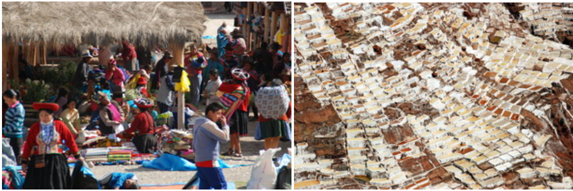
Chincheru Sunday Market / Maras Salt Pans

Day 15 Uyuni Day 2. We cross Salar de Chiguana, a thin salt crusted plain. The track climbs 4000m plus to the only active volcano in Bolivia, the 5865m Ollgue. The scenery along the way is excellent, flanked by rust coloured plains and topped by snow-capped mountains. The area abounds with wild vicunas, related to the Llama, Alpaca and is a distant relative of the camels. We visit a number of lakes including the surreal Laguna Canapa with its multi-coloured mineral-filled waters. The thriving mirco-organisms provide ample food for the large populations of flamigos (3 kinds), ducks and various other birds. The road goes even higher to 4500m across Pampa Siloli, a high altitude desert of volcanic ash and gravel., scattered with rock outcrops blasted into contorted shapes included the famous "stone tree". Soon after we enter Reserva Eduardo Avoro, where one finds the biggest lake in Uyuni. Laguna Colorada (Red Lagoon/lake), which has a huge seasonal population of reddish flamingoes which feeds on the natural red pigmented algae. The fringes of the lake are coloured white with chemical Borax. ON multi-bedded rooms near Laguna Colorada.