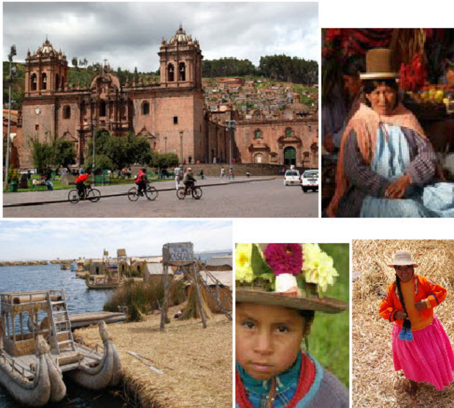
Capital of Incas CUSCO / Locals / Reed boat at Lake Titicaca

Day 10 Cusco to Puno. We board 730AM bus tour on the Tourist Bus Tour to Puno, a journey of 380km over the surreal Altiplano (high altitude Andean plateau), its highest point at La Raya 4335m. The stops include Andahuayllillas, a 3122m Mestizo baroque architecture church and Raqchi at 3400m Inca temple of Wirachocho God and home to Raqchi people with their distinct clothing. It is amazing to note that there were 20,000km of Inca Trail, which are rock paved trails linking the vast Inca Empire. It also passes through towns like Raqchi. Estimated arrival time in Puno is 5PM. Tour cost includes lunch and entrance fees are included in trip cost. ON Puno.