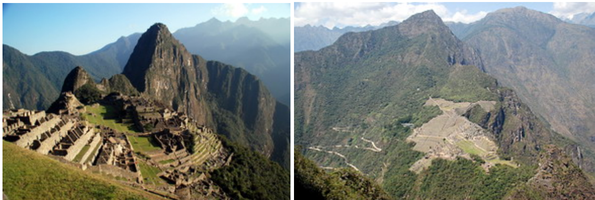
Machu Picchu Standard View / Alternate view Machu Picchu from Huayna Picchu

Day 17 San Pedro de Atacama. We have a free day to take it easy in pretty little village, catching up with emails and relaxing. Recommended trips include bicycling to some sights in the vicinity. After dinner, we board the 8PM for the 10hr overnight express bus to the town of Arica, located the Chile/Peru border. ON Bus.