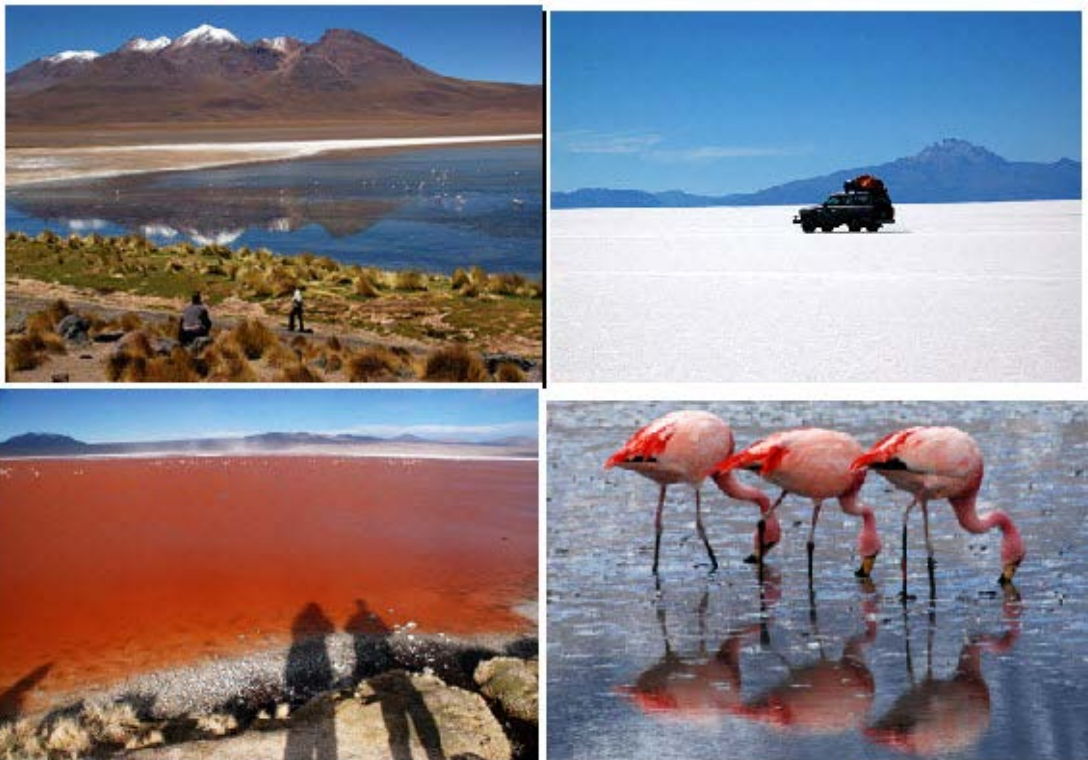
Uyuni Laguna Canapa/ Uyuni Salt Flats / Laguna Colorada / Flamingos

This will be a semi-backpack experience using a couple of local express bus rides and some chartered buses traveling from town to town. We stay in good clean guesthouse in all places except for 3 days Salar Uyuni tour. It is important participants manage their own luggage. Note 26/28 inches bags are not allowed on Yongo trips. Like most Yongo trips, you pay for your own meals and entrances, except for those specified below. You also pay the within-the-town taxis and other activities not specified below.