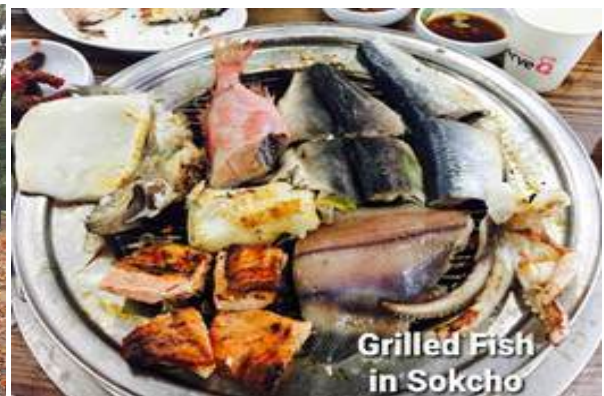
Grilled Fish in Sokcho

Day 5 SOKCHO (EAST COAST) Morning is Free & Easy, then we check-out and re-group before noon to bus 2.5 hours to Sokcho, which is a coastal town by the East Sea (or Sea of Japan) and gateway to nearby Seoraksan National Park. This pleasant fishing town is well known for its raw-fish eateries. We take leisure walk around the nearby lake, dinner at local joint, pack some food and rest early for tomorrow mini hike. ON Sokcho.