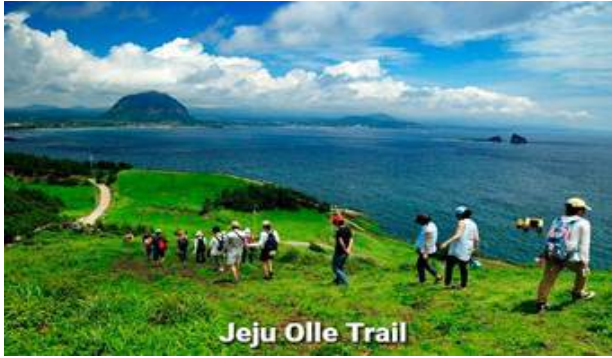
Jeju Olle Trail