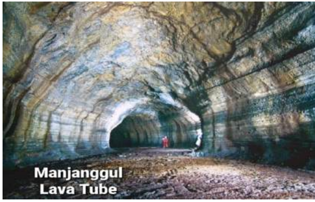
Manjanggal Lava Tube