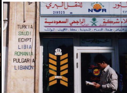
Souk in Aleppo / Destinations from Aleppo Bus Station