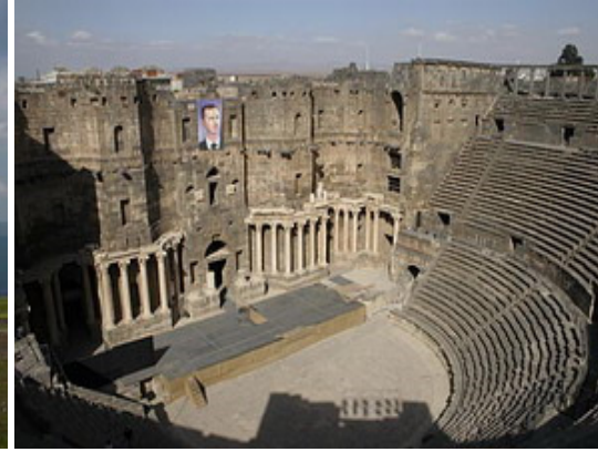
Krak des Chevaliers / Bosra Roman Amphitheatre

Day 9 Qala'at Salah ad-Din Castle & Lattakia : We bus to Lattakia 3.5hr, a busy port even since Roman times and one of the least conservative cities in the country. On the way there, we visit Qala'at Salah ad-Din Castle (Saladdin Castle), an ancient Crusader's Castle, second fiddle to Krak des Chevaliers but is perched on top of a heavily wooded ridge with near-precipitous sides dropping away to surrounding ravines. Built by the Crusaders, control exchanged hands a couple of times before it was finally abandoned. Lattakia is a modern Christian ON Lattakia.