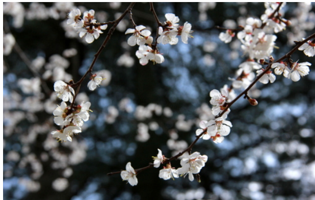
Monkey God in Shimla/ Flower Blossom at Himachal

Day 1 Fly to Delhi: Depart KL(KLIA2) on D7182 at evening flight 1900PM arriving Delhi local time 2200PM. We will wonder around Delhi town. Transfer to hotel. Overnight (ON) Delhi.