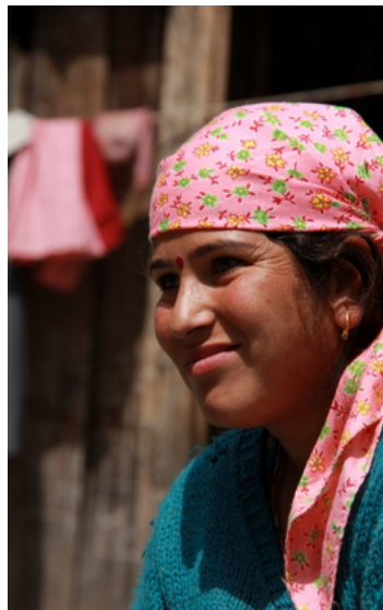
Local People Solang Valley, Manali

Day 7 Manali Dharamsala: Early morning drive 260 km 8-9 hours to Dharamsala (including visiting places) stopping at the Town of Shiva – Baijnath and visit the 13th century Shiva temple. According to legend the Demon king of Lanka Ravana (Who have got 10 head) as per epic Ramayana offered his nine head to Lord Shiva for the boon of immortality. But the Shiva was not impressed, finally he decides to offer his tenth head and Lord Shiva was pleased with his willingness to sacrifice his heads and blessed him with a Shivlinga. The moment when Ravana rested the Shivling on the ground at this place it became so heavy that he couldn't manage to carry it and take it to his kingdom Lanka, so he constructed a temple dedicated to Shiva at the present site. The same Shivling is in this temple till date. O/N Dharamsala.