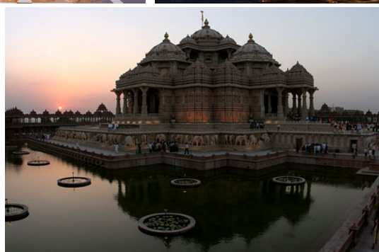
Different view of the beauty architectual of Akshardham Temple