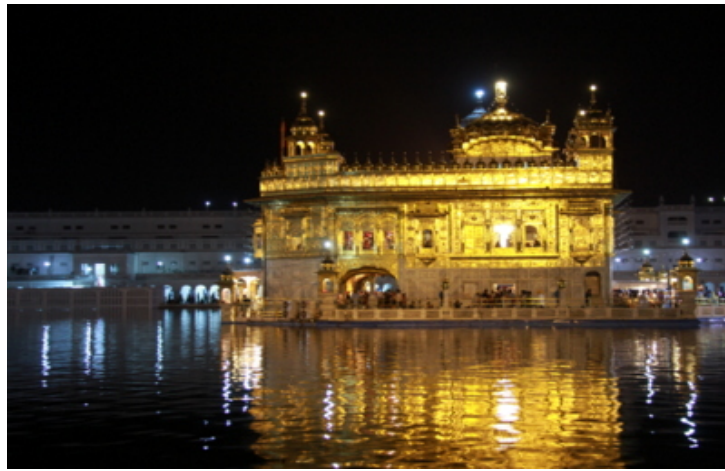
Golden Temple, Amritsar

Day 9 Dharamsala-Amritsar After breakfast drive 4-5 hours (200km) to Amritsar. Amritsar - the holy town of Sikhs, has grown from a sacred village pond into a spiritual temporal center of Sikh culture. The city gets its name from the pool - Amritsar (Pool of Nectar), which was constructed by the fourth religious preceptor of the Sikh faith. Golden Temple or Darbar Sahib is the most sacred temple for Sikhs. It is a symbol of the magnificence and strength of the Sikh people all over the world. Its architecture includes, symbols associated with other places of worship. This is an example of the spirit of tolerance and acceptance that the Sikh philosophy propounds.