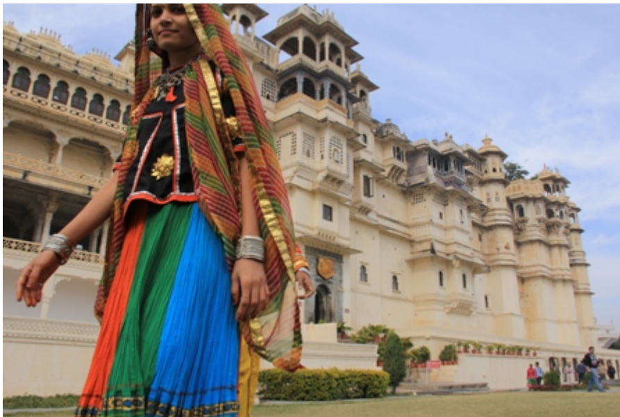
City Palace, Udaipur

This is meant to be a "free and easy" adventure trip. Participants should be relatively fit, with a good sense of humour, and above all, have the right attitude for close travel with others through possibly some trying times. Most definitely, this is not a trip for prudes, whiners, fuss-pots, and other similiarly assorted types! We had a couple of those before and it wasn't pleasant for us or them. Although every effort will be made to stick to the given itinerary, ground conditions may change and cause some disruption and/or deviation from the norm. Otherwise, have fun!