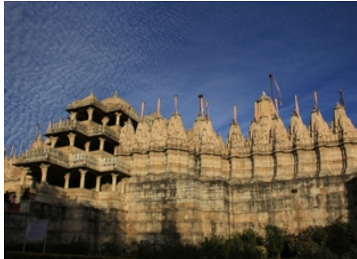
Mehrangarh fort, Jodhpur/ Jain Temple, Ranakpura

Day 1 Fly to Delhi: Fly to Delhi by Malaysia airlines (MH) at 1850pm via MH190, arriving 2150PM (OR Malindo airlines OD205 at 1805pm from KLIA, reached 2105PM). Transfer to hotel. Overnight (ON) Delhi.