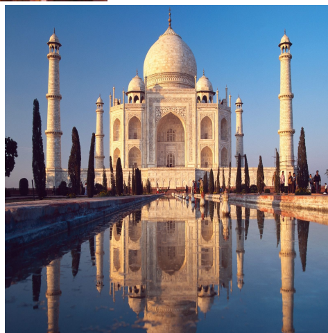
Hawa Mahal/Taj Mahal

Day 13 Back to Delhi: Early morning, visit Taj Mahal and Red Fort. Taj Mahal is one of the most beautiful masterpieces of architecture in the world. Built entirely by white marble, Taj Mahal is regarded as one of the eight wonders of the world. Some Western historians have noted that its architectural beauty has never been surpassed. After lunch drive to Delhi ON Delhi.