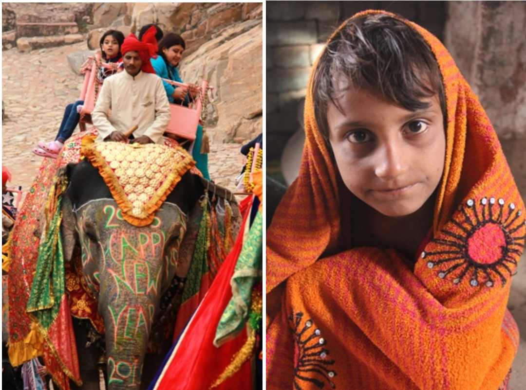
Elephant ride at Amber Fort/ Rajasthani Boy

Day 10 Pushkar-Jaipur (140km, 4hr+): In the morning visit the Brahma temple and the holy lake. On completion drive to Jaipur. Jaipur is the capital city of Rajasthan. Also known as Pink City. One of the oldest planned city. ON Jaipur