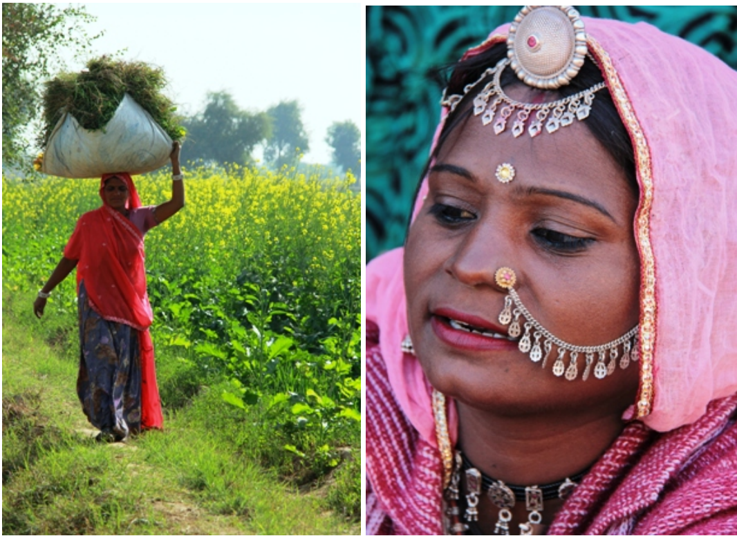
Masturd season/Rajasthani ladies

Day 5 Jaisalmer: After breakfast, walk around Jaisalmer Fort, the monolith of stone, built in 1156 atop the 80 m high Trikuta hill, is the only raised feature in a flat desolate area. We will meander through alley ways lined with havelis sporting great intricate hand - carved sand stone latticed balconies and archways. After lunch around 1300 hour drive to the start point of our camel safari through the villages to sand dunes. ON Khuri.