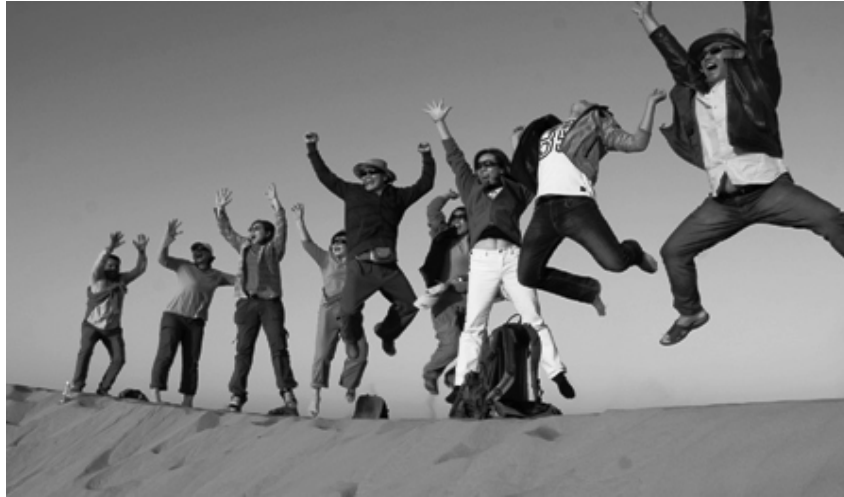
Jodhpur Mahrangarh fort & Blue City/ Group 2014 have fun at Khuri Sand Dunes

Day 8 Udaipur: Spend the rest of the day exploring this charming lake city by car. Wander through the opulent City Palace grounds and the museum, which are a testament to the valour and chivalry of the Mewar rulers. Visit the Jagdish temple on the shores of Lake Pichola. The breathtaking beauty of the lakes- Pichola & Fateh Sagar truly make Udaipur an oasis in the desert. Return to hotel after city drive. Dinner & overnight stay at the hotel. ON Udaipur.