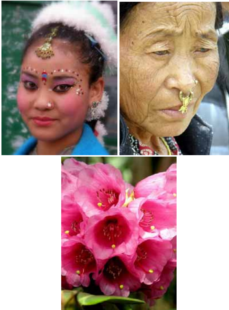
Sikkimese people/ Rhododendrons

costumes advised). If not, just enjoy the scenic surrounding. Back to Lachung for lunch and rest of day, free to walk round the villages. ON Gangtok.