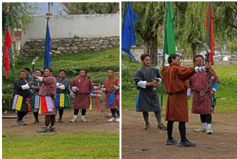
National Archery in Bhutan

Day 16 Home: Take AK62 at 0045AM and reach KL 0720AM early morning on FRI 30 April 2016