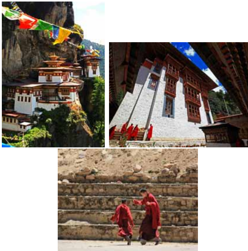
Tiger Nest/Monks/ Little Monk Football match

Day 9 Darjeeling Phuentsholing (Bhutan) (175km, 6hrs drive): Drive to Phuentsholing and met by Bhutan representative. After clearing immigration formalities, check at Hotel. Visit Zangtho Pelri, situated in city centre, this small temple represents the heaven of Guru Rinpoche. On ground floor there are statues of eight manifestations of Guru Rinpoche and paintings on Buddha's life while the next floor contains eight Bodhisattavas and statues of Avalokiteshvara and Shabdrung Ngawang Namgyal. On top floor, there is a main statue of Amitabha. Evening explore local marke. O/N Phuentsholing.