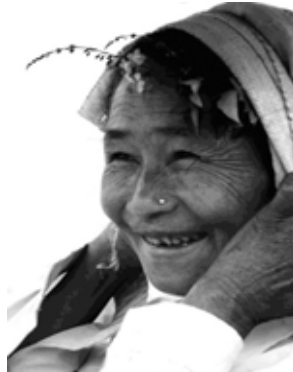
View of Kangchenjunga from Goechala/Darjeeling "tea" town/ Tea lady

Day 3 Tsomgo Lake Excursion (4-5 hrs drive) : After breakfast, drive to Tsomgo Lake, also means as The Source of the Lake (3,780m). Warm clothes needed for this place. The lake derives its water from melting snows off the surrounding mountains, which is one of the famous sacred lakes in Sikkim, situated near the borders of Tibet. On arrival Tsamgo lake start our short trek for 3 Hrs to Tsamgo range which is 4230 Mtrs Back to Tsamgo lake heaving lunch after lunch drive back to Gangtok visit Sikkim Flower Exhibition Centre where a wide range of rare species of orchids display (Seasonal). Evening walk around the local market. 2nd night Gangtok.