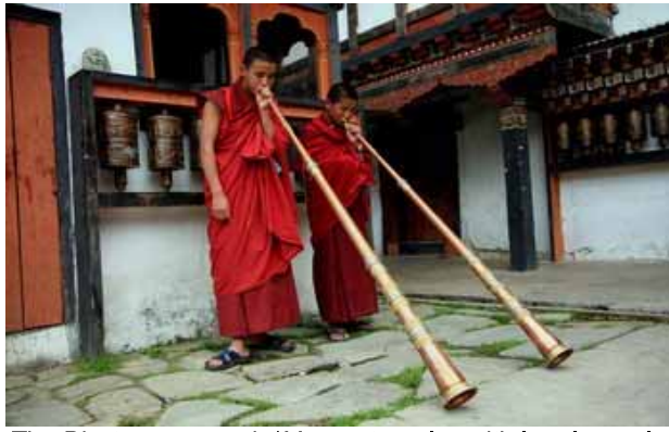
The Bhutanese monk / Yungo traveler with local people

Day 13 Punakha-Paro (125km, 4hrs+ drive): Morning excursion to Chimi Lhakhang. About 400 years old, maintained by a monk with 42 trainees, and linked to Lama Drukpa Kinley, The Divine Madman. Afternoon visit to Ta Dzong (National Museum) and Rinpung Dzong. ON Paro.