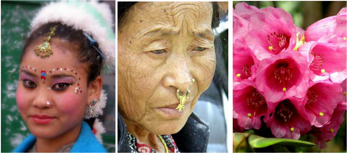
Sikkimese people/ Rhododendrons

Day 6 Gangtok-Rumtek- Rawwangla- Namchi (140km, 3-4 hrs drive) _ Today our drive brings us south west towards Namchi with several stops along the way. Our first stop is Rumtek Monastery. Rumtek served as the main seat of the Karma Kagyu Lineage in Sikkim for a period of time. But when Rangjung Rigpe Dorje, 16th Karmapa arrived in Sikkim in 1959 after fleeing Tibet, the monastery was in ruins. Despite offers at other sites, the 16th Karmapa decided to rebuild Rumtek. We then drive to Singtam for lunch. After lunch, we proceed to Rawangla to visit Tathagata Tsal, also known as Buddha Park. It was constructed between 2006 to 2013 and features a 130 feet high statue of Buddha as its centerpiece. The site was chosen within the larger religious complex of the Rabong Gompa (Monastery), which has served as a place of pilgrimage for centuries. We finish day with a drive to our hotel at Namchi. Namchi commands panoramic view of snow-capped mountains and vast stretches of valley. It is also headquarters of South Sikkim district. O/N Namchi.