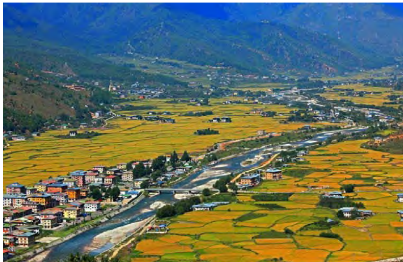
landscape View in Bhutan

This is meant to be a "free and easy" adventure trip. Participants should be relatively fit, with a good sense of humour, and above all, have the right attitude for close travel with others through possibly some trying times. Most definitely, this is not a trip for prudes, whiners, fuss-pots, and other similiarly assorted types! We had a couple of those before and it wasn't pleasant for us or them. Although every effort will be made to stick to the given itinerary, ground conditions may change and cause some disruption and/or deviation from the norm. Otherwise, have fun!