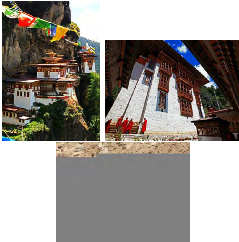
Tiger Nest / Monks / Little Monk Football match

visit Zangtho Pelri, a small temple representing the heaven of Guru Rinpoche. On the ground floor there are statues of the eight manifestations of Guru Rinpoche and paintings on Buddha's life. The next floor contains eight Bodhisattavas and statues of Avalokiteshvara and Shabdrung Ngawang Namgyal. Top floor houses a main statue of Amitabha. Evening free & easy to explore the local market. O/N Phuentsholing.