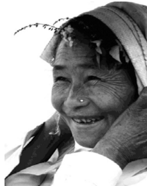
View of Kangchenjunga from Goechala/Darjeeling "tea" town/ Tea lady

Day 3 Tsomgo Lake Excursion (4-5 hrs drive) : After breakfast, we drive to Tsomgo Lake, also known as The Source of the Lake (3,780m). Warm clothes are needed for this place. Tsomgo lake is one of the famous sacred lakes in Sikkim and derives its water from melting snows of the surrounding mountains near the borders of Tibet. After arriving at Tsomgo lake, we start our short trek to the Tsomgo range around 4230metre. We return to Tsomgo lake for lunch. After that, we return to Gangtok for a visit to Sikkim Flower Exhibition Centre which houses a wide range of rare species of orchids (Seasonal). Evening walk around the local market. 2nd night at Gangtok. (Optional one can up to cable car to have an overview of the mountainscape (Cable car own expenses Rupee 295).