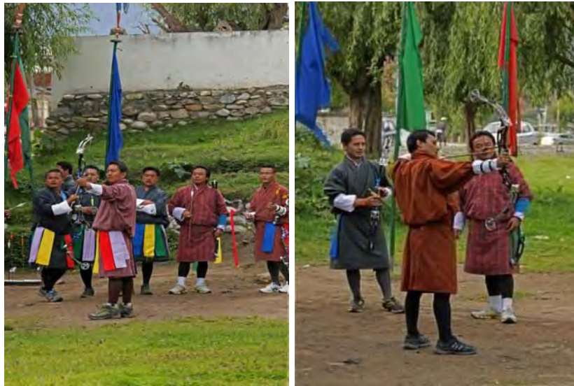
National Archery in Bhutan

Day 16 Home: Take AK62 at 0045AM to reach KL 0710AM early morning on THU 2 May 2019