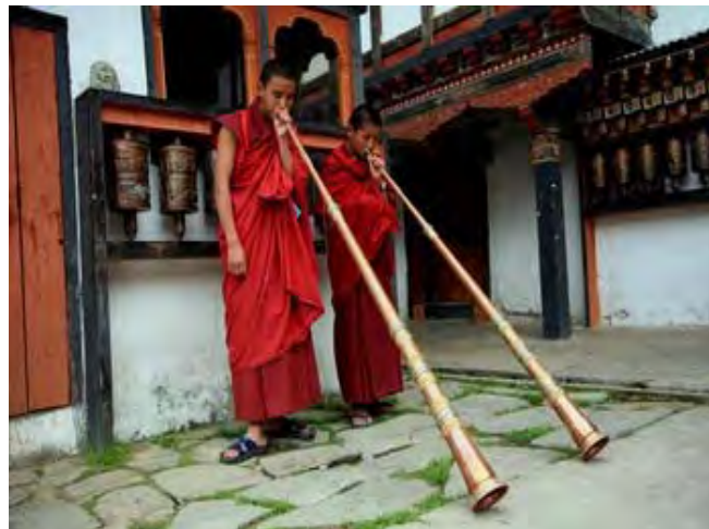
The Bhutanese monk / Yongo traveler with local people

Day 13 Punakha-Paro (125km, 4hrs+ drive): Morning excursion to Chimi Lhakhang. About 400 years old, the monastery is maintained by a monk with 42 trainees, and is linked to Lama Drukpa Kinley, The Divine Madman. We spend the afternoon driving towards Paro for our next 2 nights stay. En route, we will visit Ta Dzong (National Museum) and Rinpung Dzong. O/N Paro.